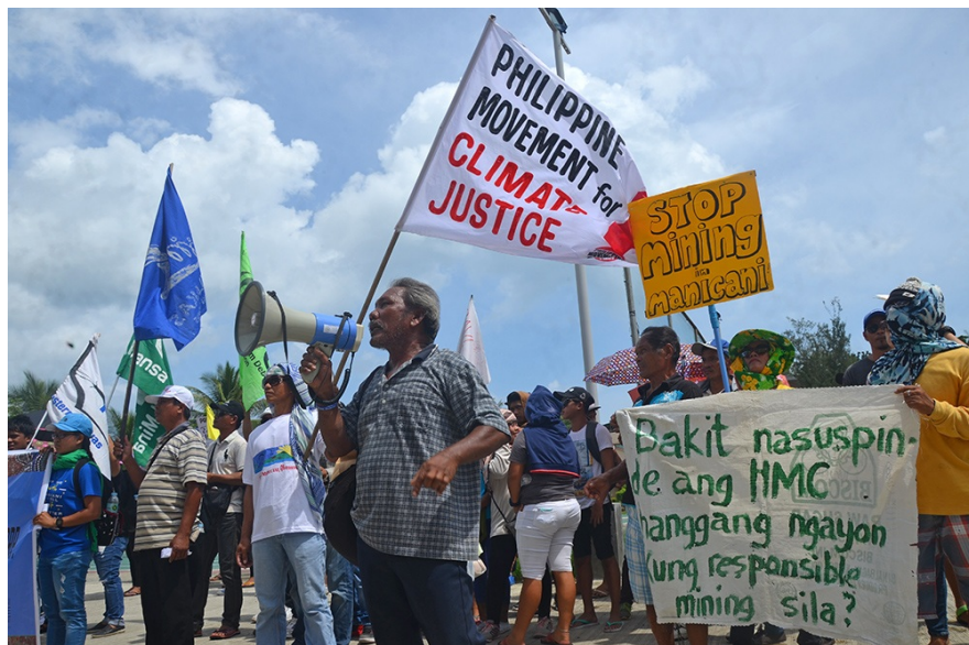
Different groups gather outside the office of the Eastern Samar Provincial Board to protest the renewal of the permit of a nickel mine in Manicani Island, Oct. 27, 2017. ALREN JEROME BERONIO

BORONGAN City – Permit renewal requested by a mining company has the Church and many residents worrying about the possibility of further destroying the environment of Manicani, a small island off Eastern Samar.